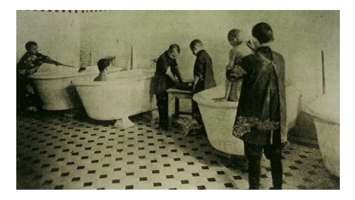
La sala da bagno della Casa degli Orfani.